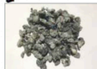
Dry & Densifier

Note : Squeezer is individual operate in some material